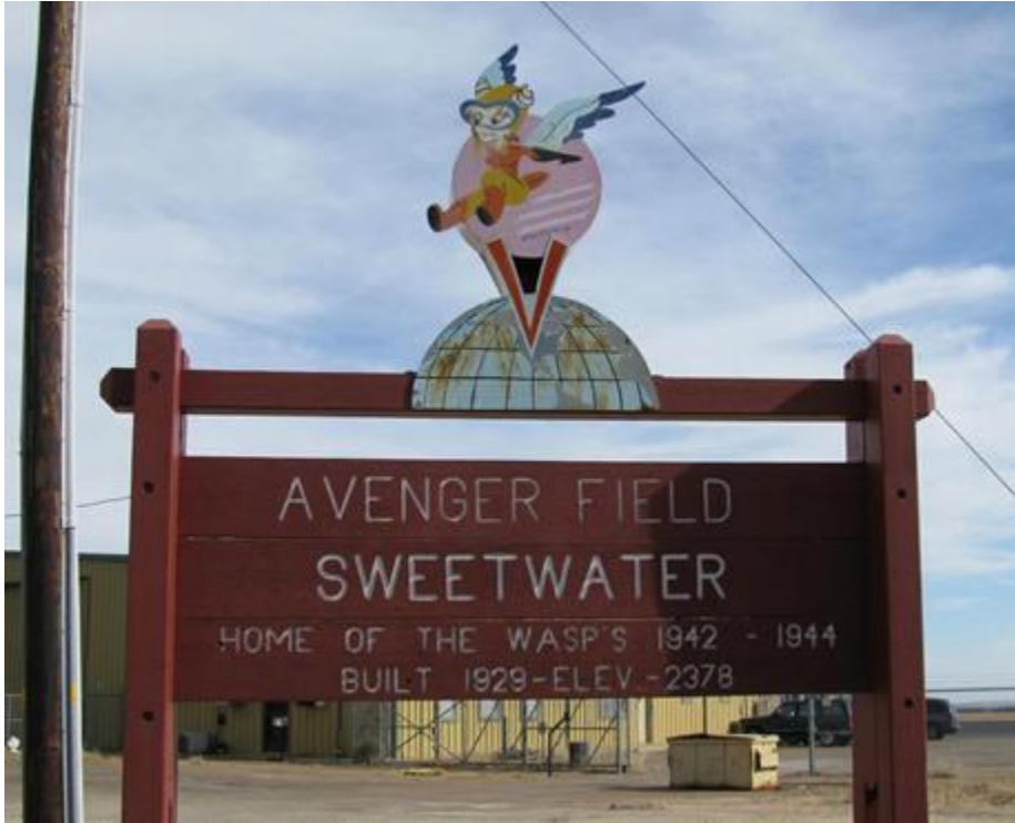
The Former Avenger Field location at Sweetwater's Airport

Department leased it for a token payment of $1.00 per year.