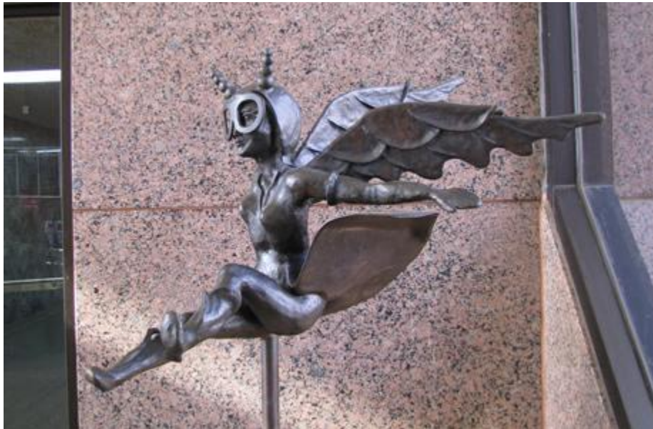
3-D Statue of "Fifi" (Finfinella) is in the Nolan County Courthouse lobby. The mascot design was supplied by the Walt Disney Co.

The only flying B-29, owned by the CAF in Midland , carries the nose art name of FIFI. - Mike Price, December 08, 2007