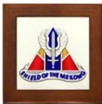
13 th CAB stuff too.