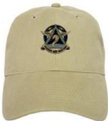
307 th CAB stuff from Corky's