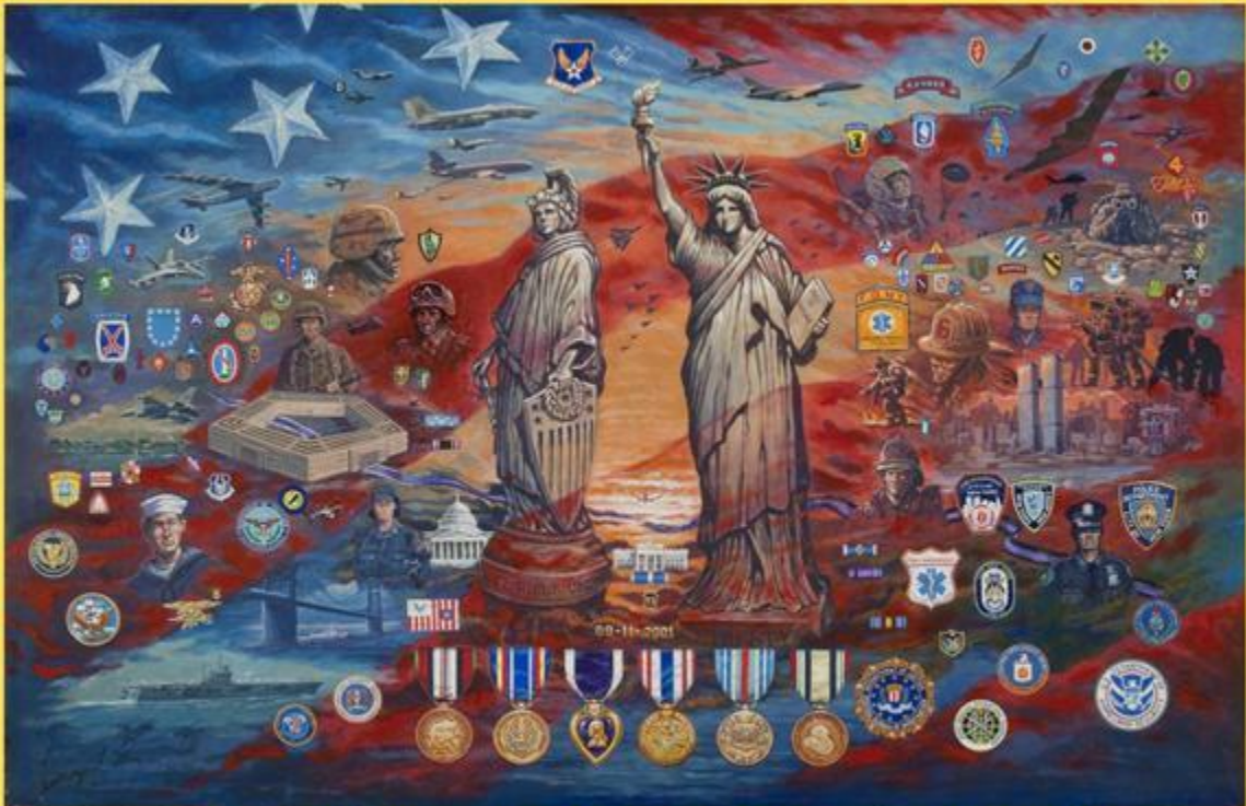
“Assured Victory..A 09-11-2001 & War On Terrorism Memorial”