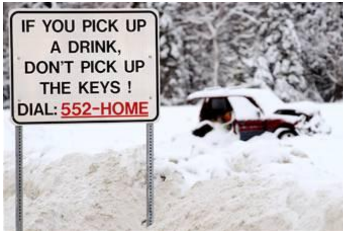
Elmendorf AFB, Alaska